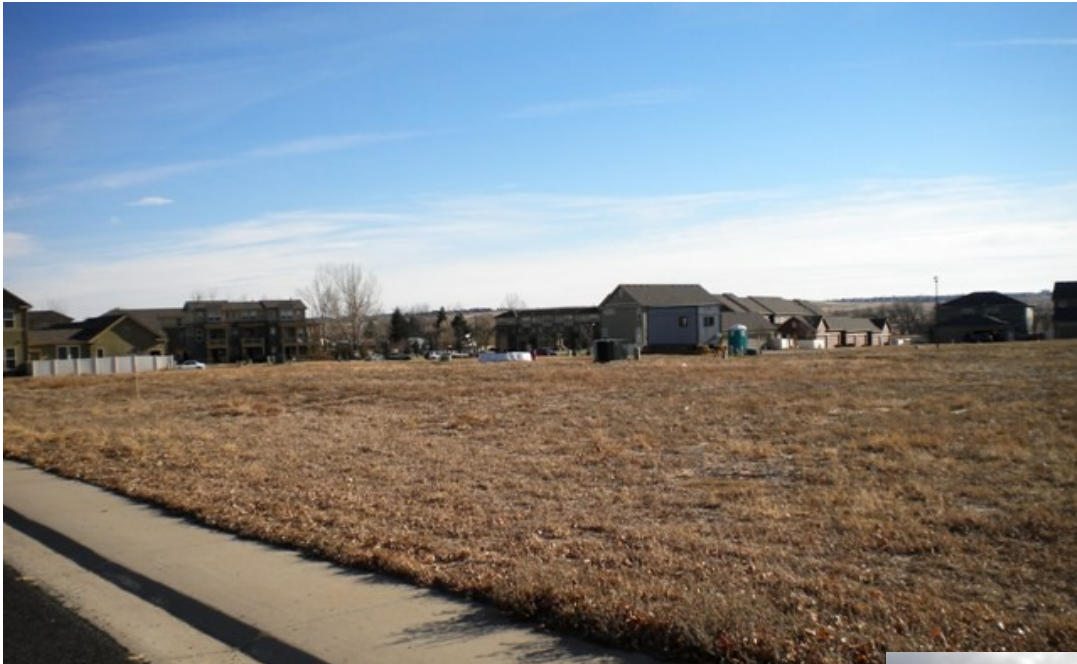
Coal Creek Village Land Site Dec 2010