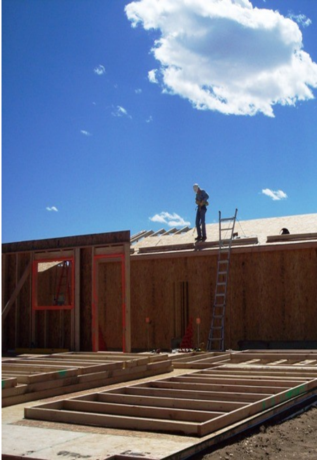
Roofing and framing