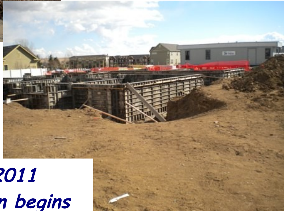
March 2011 Construction begins