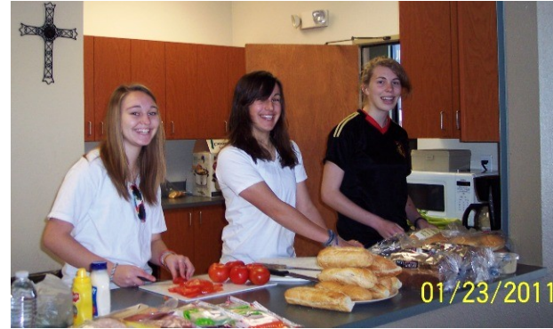
Making lunch for the construction workers